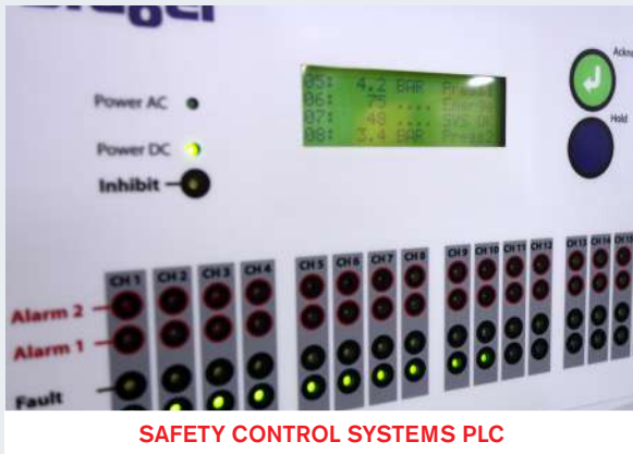
SAFETY CONTROL SYSTEMS PLC