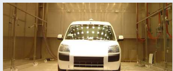
SUN SIMULATOR DRIVE-IN