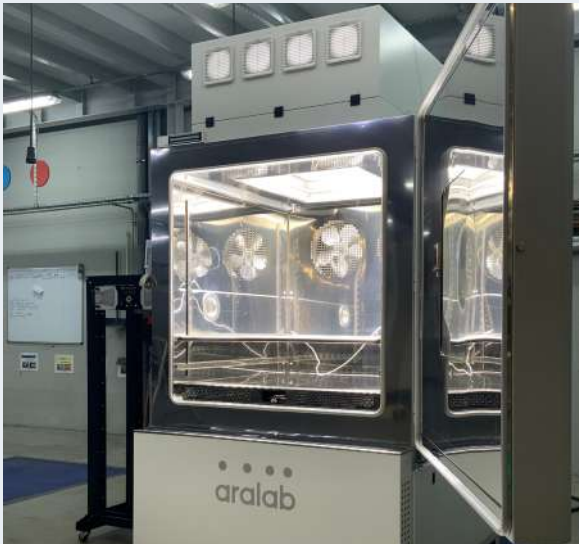
SOLAR AND UV RADIATION CHAMBER