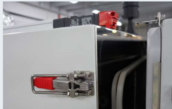
MAGNETIC DOOR LOCK AND MANUAL LATCHES