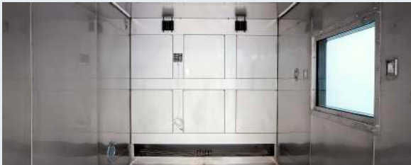
WALK-IN CLIMATIC TESTING