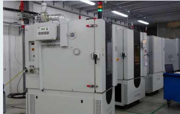
TESTA ATEX CHAMBER