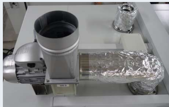
FLUSHING / PRESSURE RELIEF SAFETY