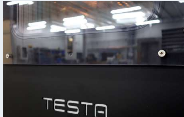
POLYCARBONATE WINDOW PROTECTION