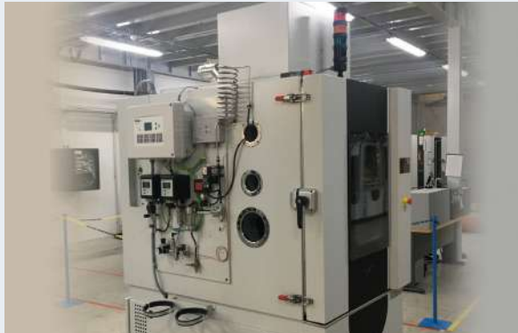
TESTA BATTERY TESTING CHAMBER