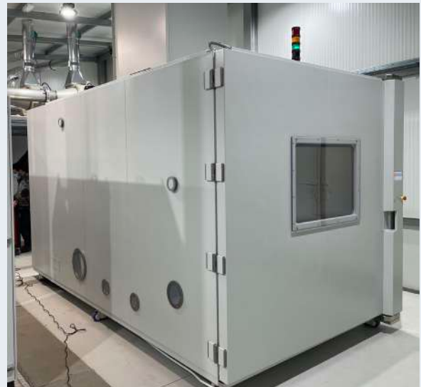
EUCAR ATEX WALK-IN CHAMBERS