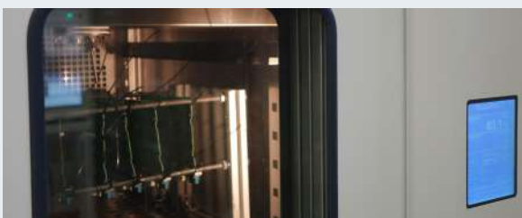
TEMPERATURE SHOCK CHAMBERS