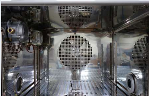
GAS SENSORS, FIRE DETECTORS