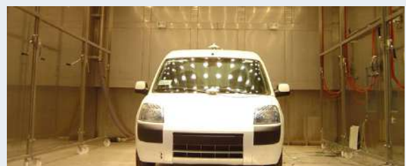
SUN SIMULATOR DRIVE-IN