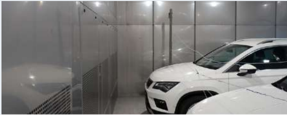
DRIVE-IN AUTOMOTIVE TESTING

If you find that standard test chambers don't meet your size needs, or your testing requirements demand a custom solution, Aralab provides you with an extensive range of options. As a comprehensive solution provider, we engineer and build testing chambers and rooms from walk-in test chambers to vehicle-sized test rooms, allowing for expansive testing space. Furthermore, our portfolio expands to include test systems for solar radiation, temperature shock, ATEX protection chambers, vibration tests, and multi-axial shaker tables (MAST).