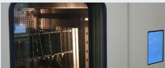
TEMPERATURE SHOCK CHAMBERS