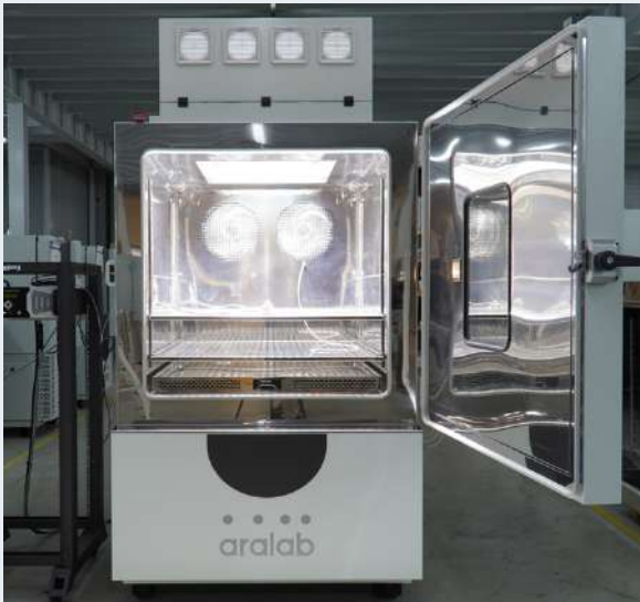
SOLAR AND UV RADIATION CHAMBER