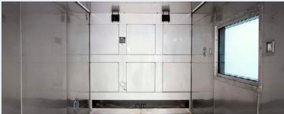
WALK-IN TEST CHAMBERS